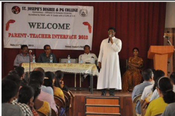
Principal's address on the Interface day