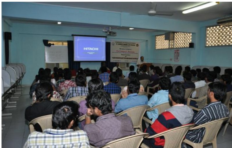
Inaugural & Interaction Sessions