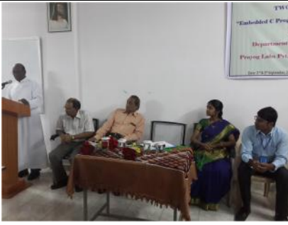
Day 1: Inaugural Session